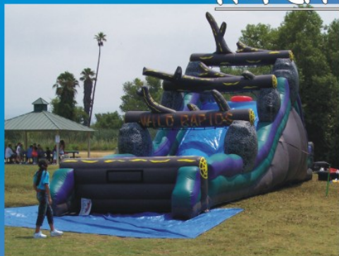
Wild Rapid Water Slide